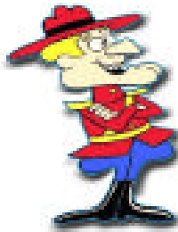
Awards by Dudley's Trophies (727) 321-1210

ENTRY FEE: $15 PRE REGISTER or $20 DAY OF SHOW