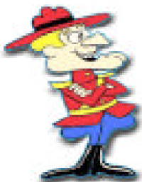
Awards by Dudley's Trophies (727) 321-1210

ENTRY FEE: $15 PRE REGISTER or $20 DAY OF SHOW CARS FOR SALE $10.00 Day of Show