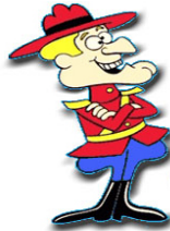
Awards by Dudley's Trophies (727) 321-1210