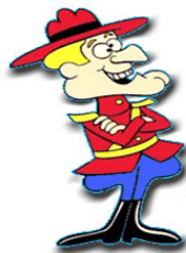
Awards by Dudley's Trophies (727) 321-1210