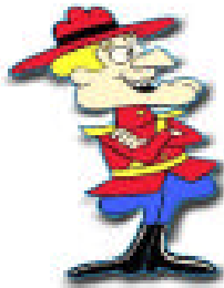
Awards by Dudley's Trophies (727) 321-1210

ENTRY FEE: $15 PRE REGISTER or $20 DAY OF SHOW