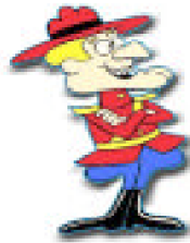
Awards by Dudley's Trophies (727) 321-1210