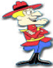
Awards by Dudley's Trophies (727) 321-1210