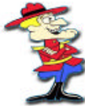
Awards by Dudley's Trophies

TROPHIES: 4 BEST OF SHOW PLUS 1 OVERALL BEST OF SHOW FOR EACH CLASS