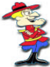
Awards by Dudley's Trophies